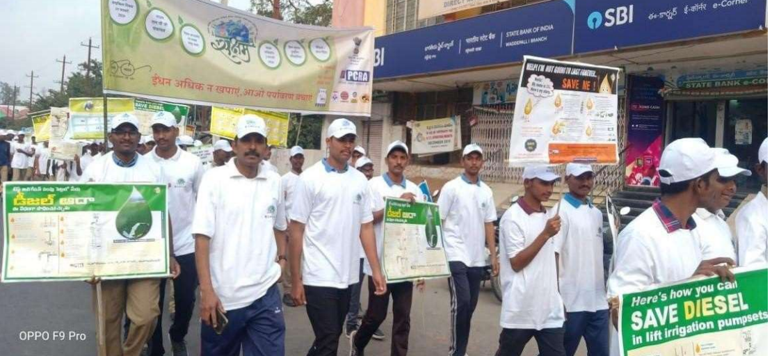
<u>Save fuel and</u> save environment <u>rally</u>